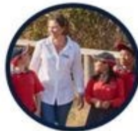
Build skills through fun